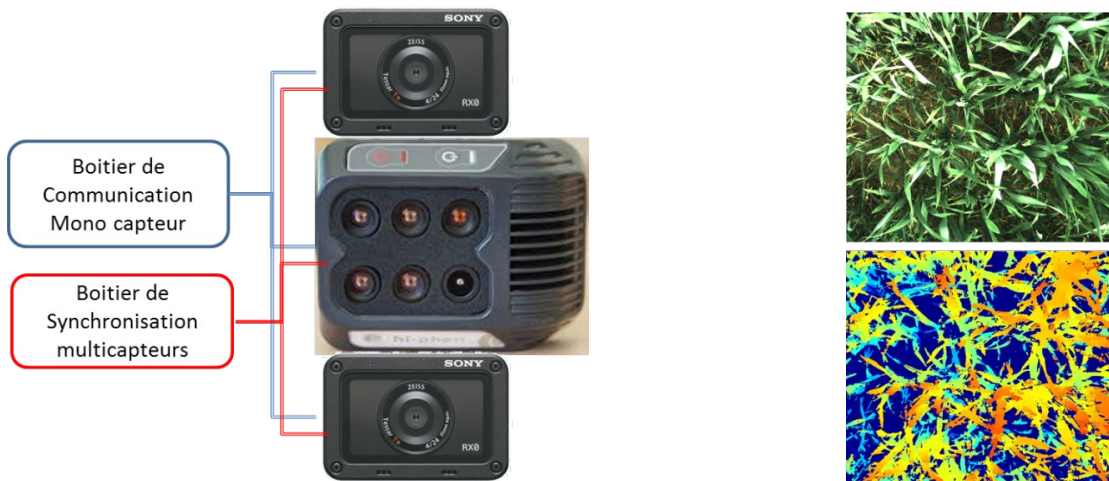
Diagram of the sensing system